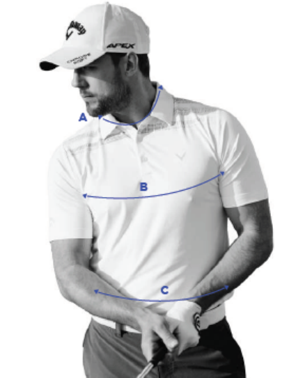
Model wears size M, Global fit. 6ft 0 with chest 42"

Measure around your waist at the narrowest part of your torso.